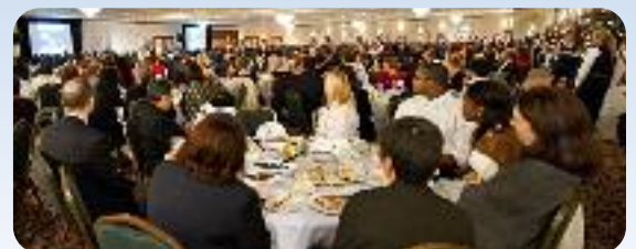
Sportsmen's Tennis Club, Dorchester, Mass., host of a women's $50,000 event, celebrated its 50th Anniversary Year with a kick-off gala on January 7.